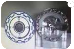
Photo 1. Assembly check and image storage

Testing, controls and tracking guarantees quality: every single stapler has to pass a firing test before being placed to the market. Moreover, every single stapler and cartridge is photographed and stored for QMS tracking, to ensure that every single staple has been correctly positioned. From Factory to the Surgeon's hands, Panther Medical Canada ensures product safety and quality in every surgical procedure.