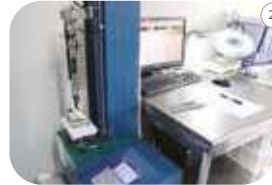
Photo 2. Firing test