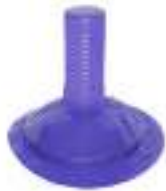
Light Handle Cover

The Purple Surgical Light Handle Covers are single use, sterile cover that fit easily and securely over our universal operating theatre light handle, which is supplied on a 'free loan' basis.