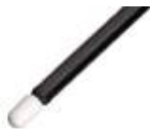
5mm Blunt Dissector

The Purple Surgical 5mm Blunt Tip Dissector allows for the safe, atraumatic manipulation and dissection of tissue during abdominal investigation.