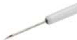
5mm Aspiration Needle

The Purple Surgical 5mm Aspiration Needle is designed for the simple, safe aspiration of fluids from cysts and organs.