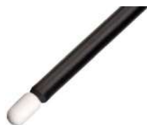
5mm Blunt Dissector

The Purple Surgical 5mm Blunt Tip Dissector allows for the safe, atraumatic manipulation and dissection of tissue during abdominal investigation.