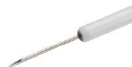
5mm Aspiration Needle

The Purple Surgical 5mm Aspiration Needle is designed for the simple, safe aspiration of fluids from cysts and organs.