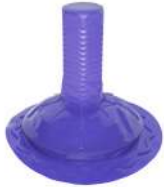
Light Handle Cover

The Purple Surgical Light Handle Covers are single use, sterile cover that fit easily and securely over our universal operating theatre light handle, which is supplied on a 'free loan' basis.